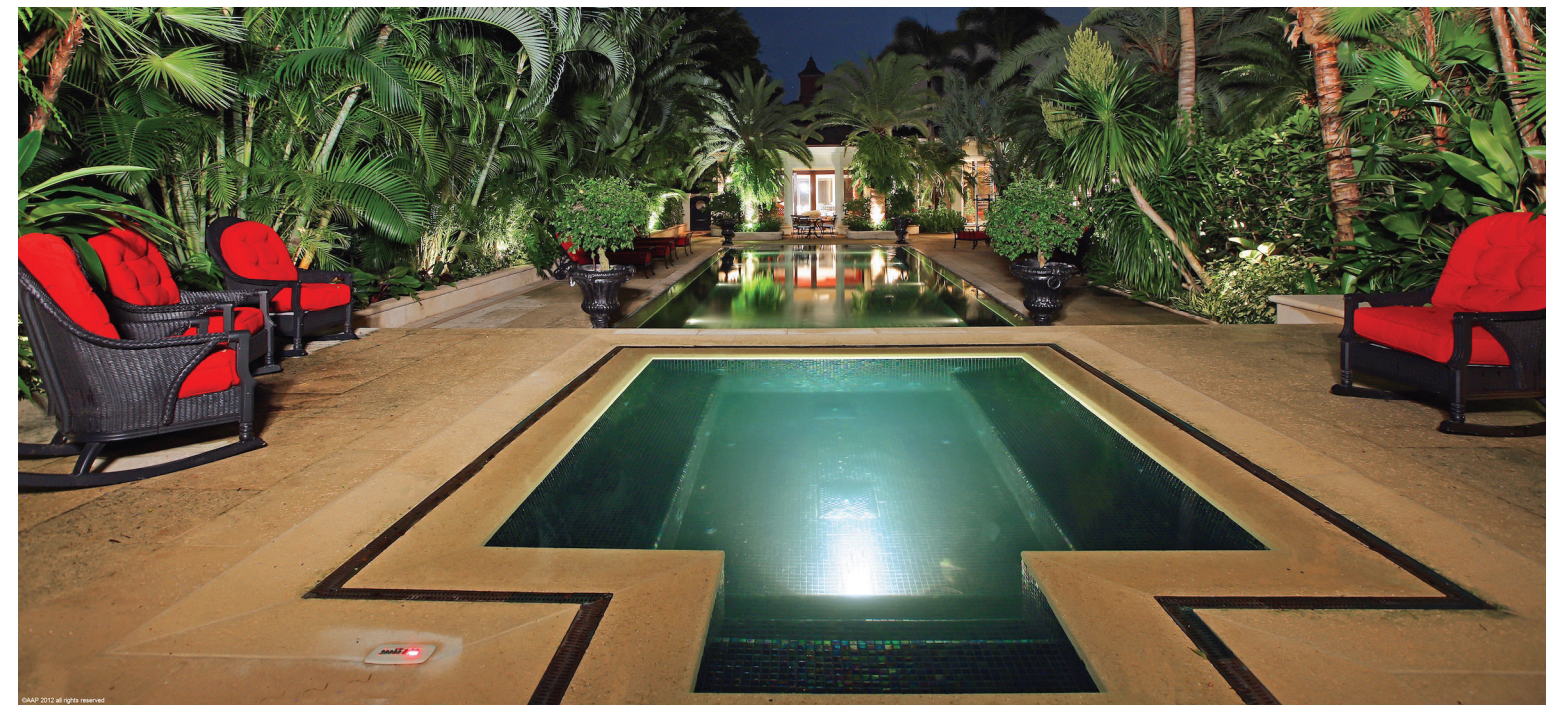
PALM BEACH POLO | BRIDLE PATH | $13,870,000

Unsurpassed estate home | located on 3 lots in the secluded section of Bridle Path in Palm Beach Polo | meticulously maintained with chef's kitchen, impact glass, AMX audio system, and Lutron Lighting | Fantech fresh air system, ArctiChill cooling, and Icynene insulation | masterfully landscaped with peaceful sitting areas overlooking gardens and gorgeous western sunsets | tranquil pool area with cascade waterfall | expansive motor court with 5.5 air-conditioned garage spaces | unique complete fitness center | private 2-bedroom guest house | Co-Listed with Ron Neal