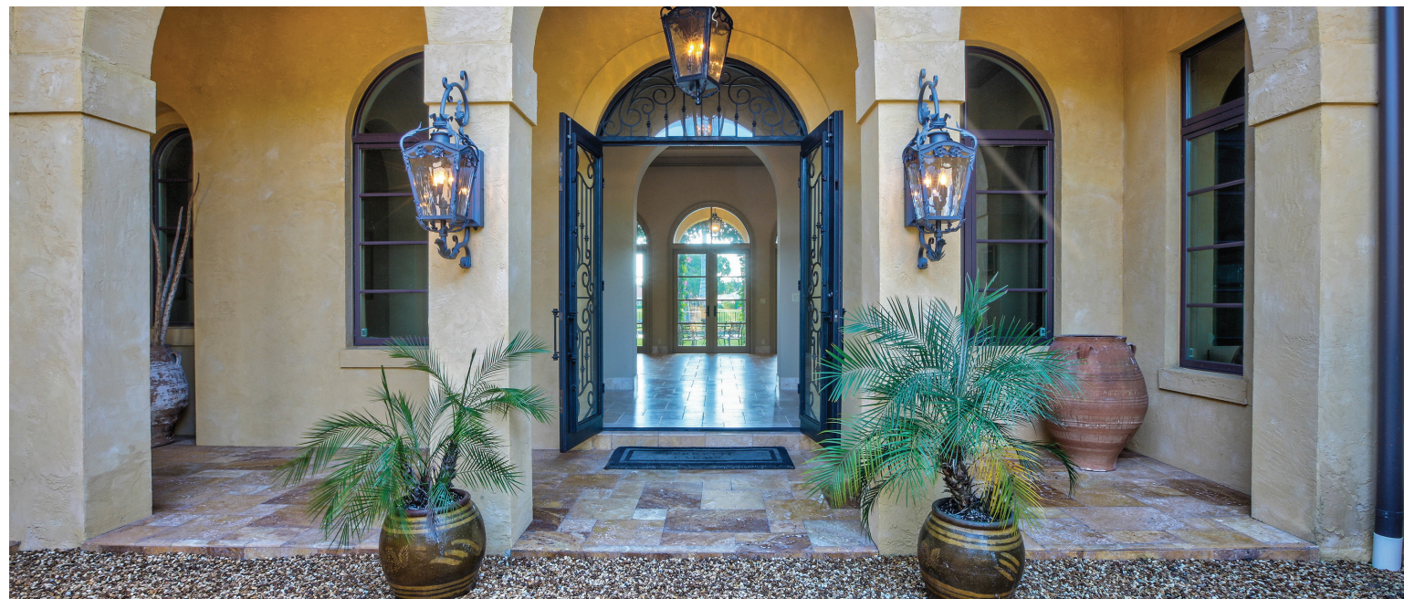
PALM BEACH POLO | CYPRESS ISLAND | $4,900,000 | PRICE REDUCTION

Spectacular architectural design | beautiful 20-acre equestrian retreat | 5-bedroom, 5.5-bathroom saltwater pool home | exclusive gated community | gourmet chef's kitchen | full impact glass, generator, and elevator | European white oak floors | guest house above 3-car garage | outdoor living and dining | 6 paddocks | large arena | 6-stall center-aisle stable with staff quarters | elevator