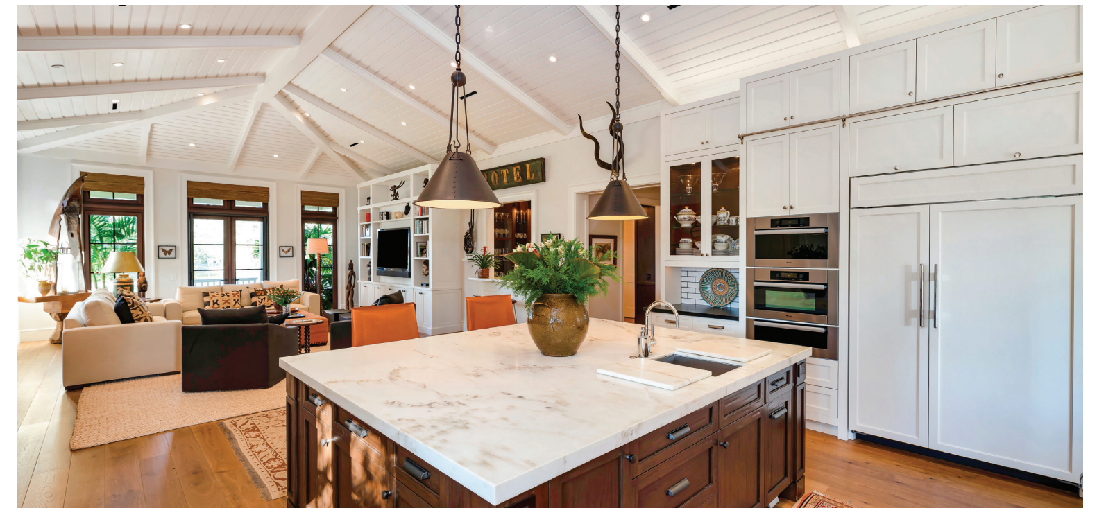
RANCH COLONY | JUPITER | $8,450,000

Spectacular architectural design | beautiful 20-acre equestrian retreat | 5-bedroom, 5.5-bathroom saltwater pool home | exclusive gated community | gourmet chef's kitchen | full impact glass, generator, and elevator | European white oak floors | guest house above 3-car garage | outdoor living and dining | 6 paddocks | large arena | 6-stall center-aisle stable with staff quarters | elevator