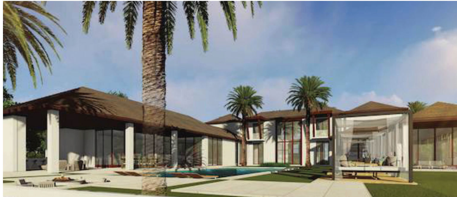
"EL SUENO" | CYPRESS ISLAND

One-of-a-kind Primark Partners, Affinity Architects, Decorators Unlimited, and Dale Construction collaboration | 11,654 square feet with 5 bedrooms | 144 feet of water frontage | rare marble imported from the hills of Italy | gorgeous walnut cabinetry sourced from Canada | custom furniture with an exclusive touch