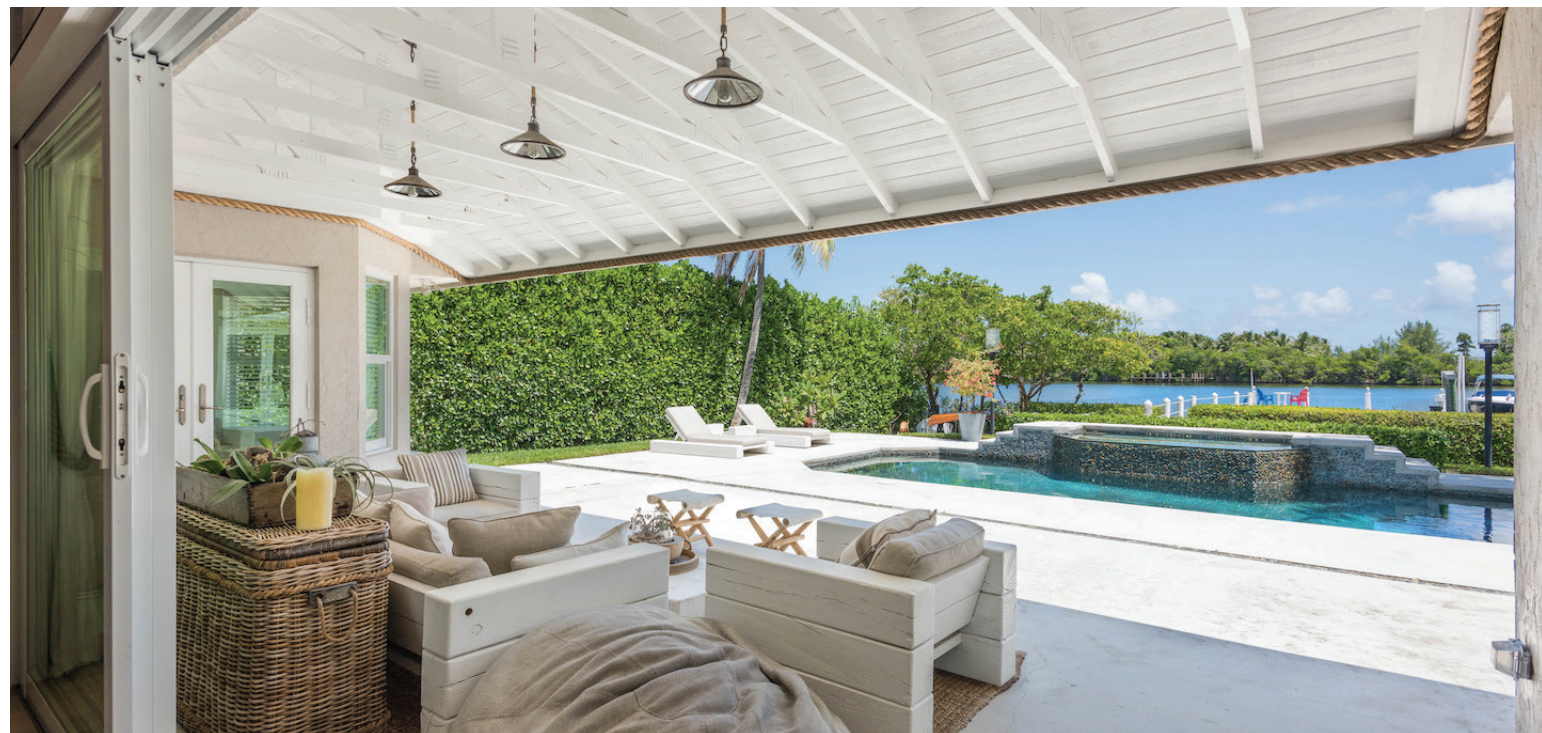
HYPOLUXO ISLAND | $3,450,000

A nod to the modern farmhouse | 4-bedroom, 3.5-bathroom estate on the Intracoastal Waterway | sunrise views | exposed beams | gourmet kitchen with custom cabinetry and gas cooking | impact glass and pristine landscaping | vaulted ceilings and hardwood floors throughout | covered lanai and open patio area with heated pool and spa | private and luxurious | Co-Listed with Sharon Loayza